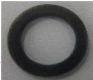
Flat washer 10